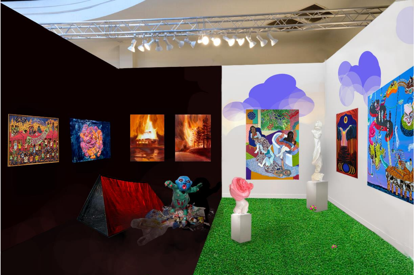
Digital rendering of the booth