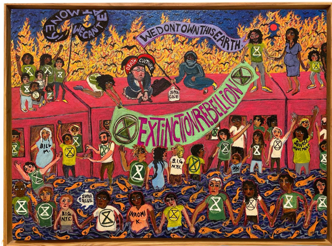
Haley Hughes, We Can't Eat Money , 2020 oil on canvas 16" x 23"