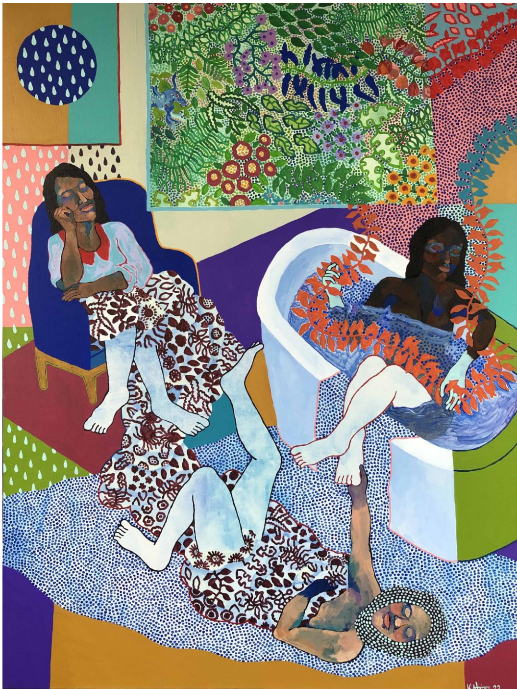
Katrina Jurjans, Dreaming Rain (Speaking Water) , 2022 acrylic on canvas 40" x 30"