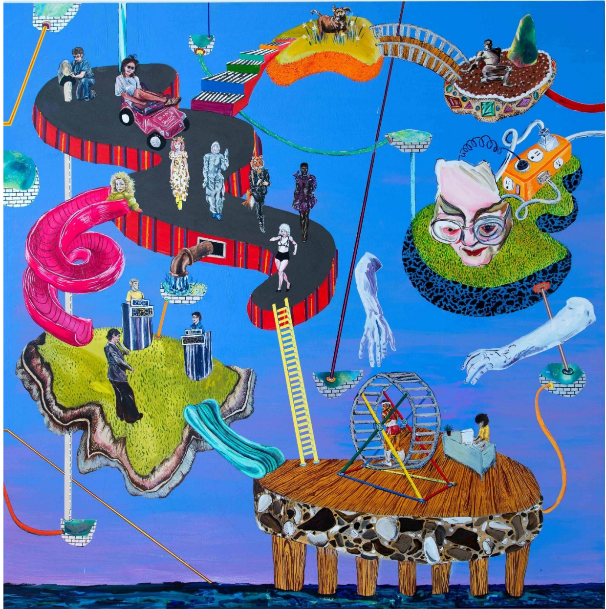
Sarah Fuhrman, Run-A-Way Runway , 2020 mixed media on canvas 48"x 48"